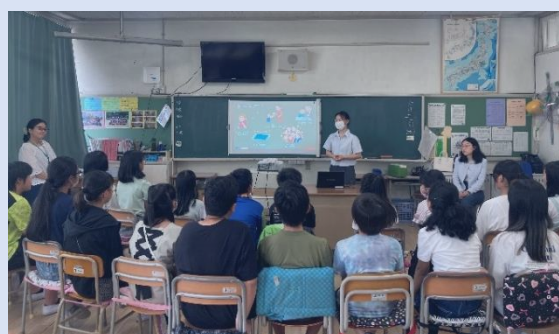
Presentation at local school