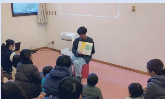
Picture book reading at local library

-All students are required to have adequate accident and health insurance coverage in home country (like as travel insurance etc...).