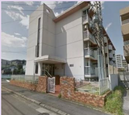
Exterior view of the dormitory

Self-contained private flat, furnished (desk, chair, closet (Japanese style), futon bedding, refrigerator, gas stove, microwave, washing machine, bathroom (toilet and bath), A/C, Wi-fi available.