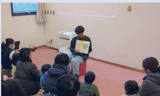
Picture book reading at local library