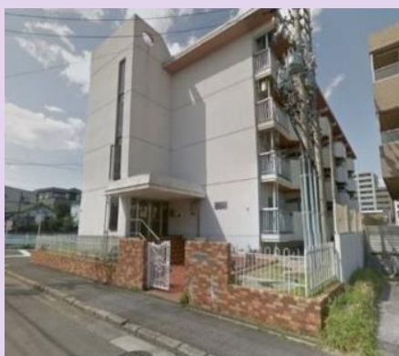
Exterior view of the dormitory

Self-contained private flat, furnished (desk, chair, closet (Japanese style), futon bedding, refrigerator, gas stove, microwave, washing machine, bathroom (toilet and bath), A/C, Wi-fi available.