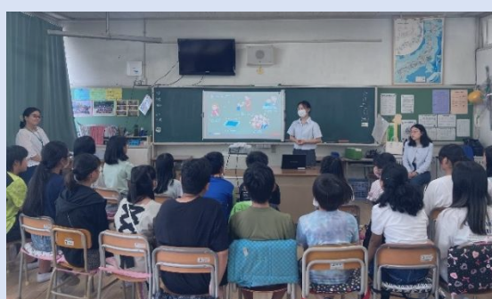
Presentation at local school