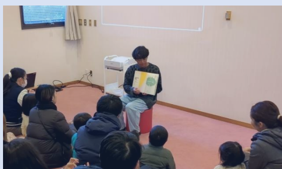
Picture book reading at local library

-All students are required to have adequate accident and health insurance coverage in home country (like as travel insurance etc...).